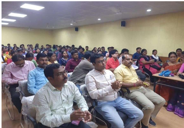
The Participants with keen attention to the speakers